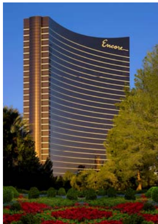
Photo printed with the Encore's permission.

We are celebrating our 35 th Anniversary