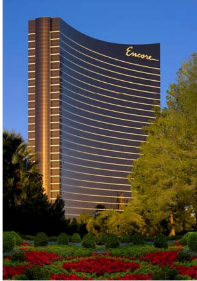
Photo printed with Encore's permission.

For hotel reservations, call the Encore Wynn Las Vegas Hotel at 1-866-770-7555 and notify them that you are attending the NASPD 2010 Convention. The NASPD weekday group rate is $159.00 plus tax per night for a king size bed and a weekend rate of $179.00 plus tax per night for a king size bed. There is a charge of $50.00 per room per night for double queen accommodations. The valid dates for the group discount are for February 24 – 28, 2010. A charge of an additional $50.00 will be added for each guest over double occupancy.