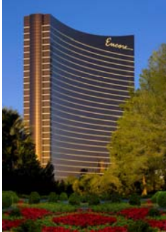
Photo printed with the Encore's permission

Make your hotel reservations direct with the Encore Wynn Las Vegas by phone. The NASPD Convention weekday rate for a resort guest suite is $159.00 per single/double occupancy and the weekend rate is $179.00. The toll free phone number for reservations is 1-866-770-7555 and notify them of the NASPD 2010 Annual Convention. If you have questions other than reservations, the main number at the Encore is 702-770-8000.