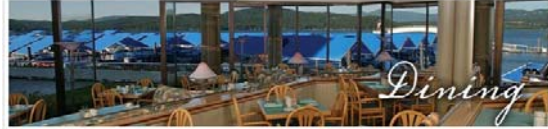
Family Friendly Lakeside Dining At Its Best

Cuisine: American Hours: Sunday – Thursday 6 am – 10 pm Sunday Brunch 9am – 2 pm Friday and Saturday 6 am – 11pm Phone: 765-4000 ext. 24 Location: Coeur d'Alene Resort