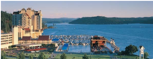
Printed with the resort's permission.

Make your reservations by calling the resort's central reservations toll free number at 800-688-5253 and notify them of the NASPD 2010 Fall Conference.