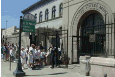
Tourists gather for a tour of the Denver Mint

320 West Colfax Avenue Denver, Colorado 80204-2693