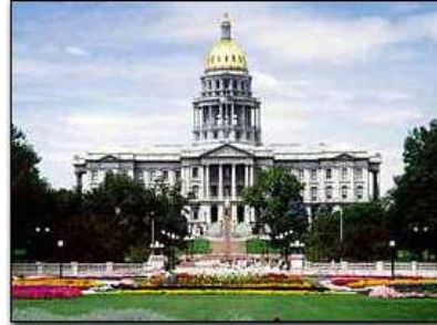
Colorado State Capitol Building

200 E. Colfax Ave. Denver, CO 80203 303-866-2604