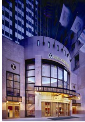
Hotel picture from the Intercontinental Hotel

Make your hotel reservations directly by going to the following link: