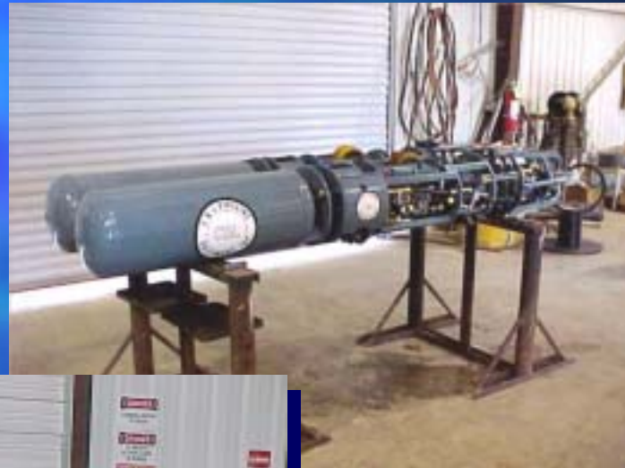
Internal Line-Up Clamps, Die Sets