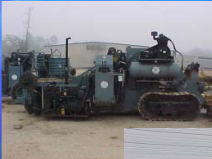
Pipe Bending Machines, Mandrels